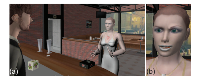
Figure 1: Screenshot of the VR bar setting

As setting for the experiment, a 3D VR bar was created: a bar room, virtual furniture, and a virtual bartender. The virtual bartender also performs typical activities, e.g., cleaning dishes, when users take longer to reply. Technical aspects of the VR process pipelines are described in (Gobron et al. submitted). Initially, users see how their avatar enters the premises and moves towards the bar counter. Upon reaching the counter, the perspective changes and an isometric view of the scene is presented, see Fig.1(a). Two windows at the top of the screen show close-ups of the bartender's and avatar's faces. See Fig.1(b) for an example of an emotional facial expression (EFE). A chat interface allows the user to type utterances and displays the bartender's responses.